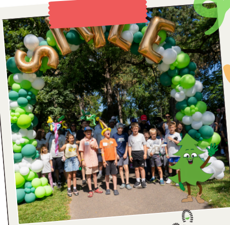
Walk & Picnic

Here is a peek at all the joy and connection you helped create!